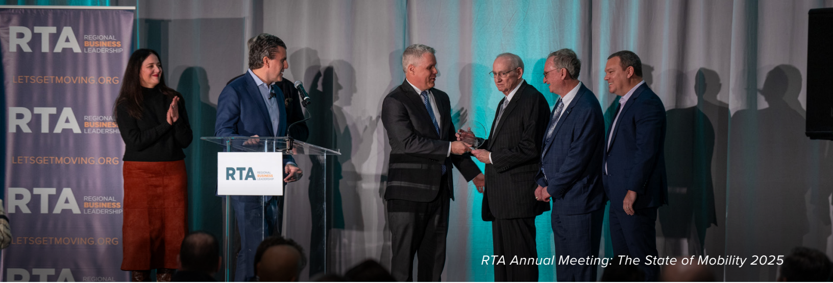
RTA Annual Meeting: The State of Mobility 2025