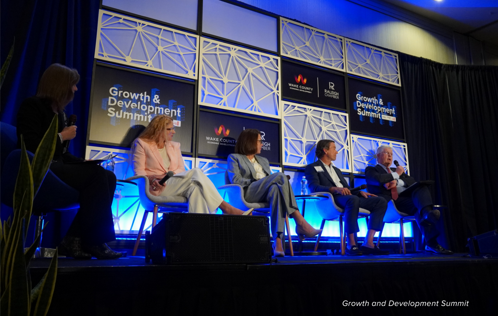
Growth and Development Summit