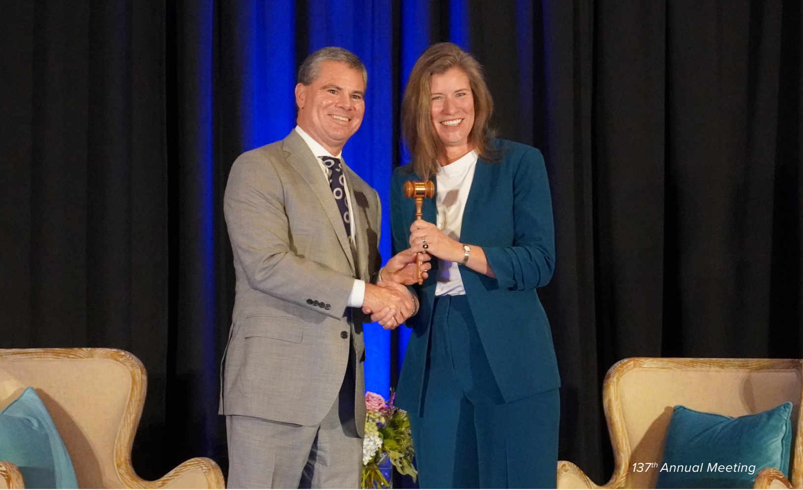
137 th Annual Meeting