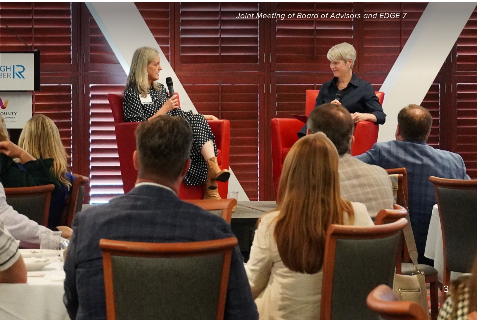
Joint Meeting of Board of Advisors and EDGE 7